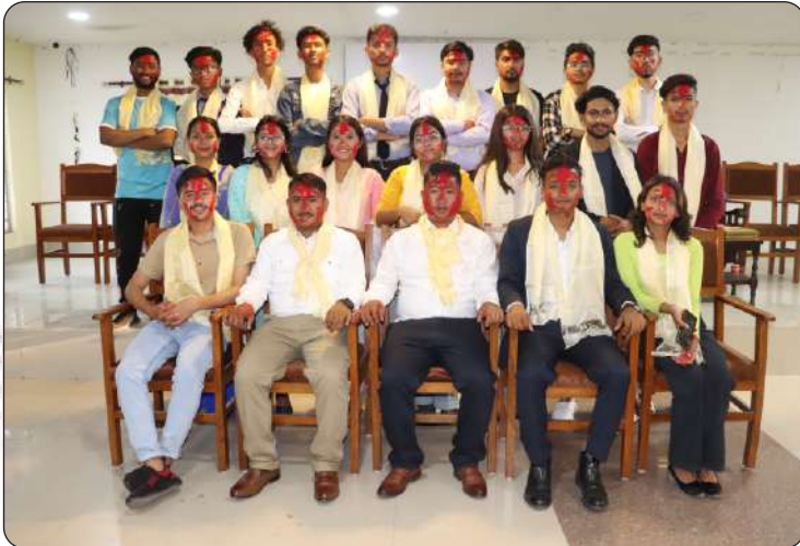
Free Student Union