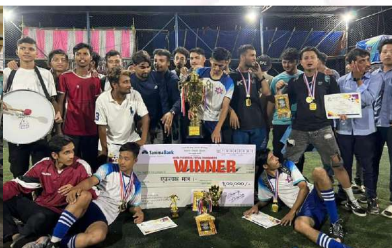
Winning Moment: Futsal Winner