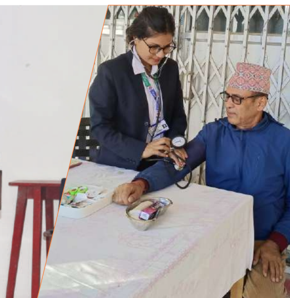
First Aid Service at College