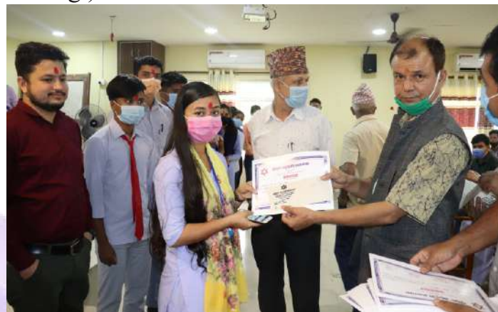
Student awarded by Scholarship