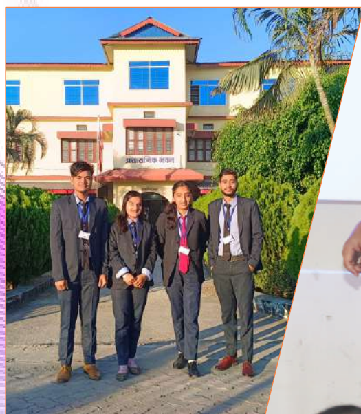
Students @ College Premises