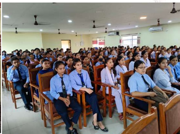
Students in Program