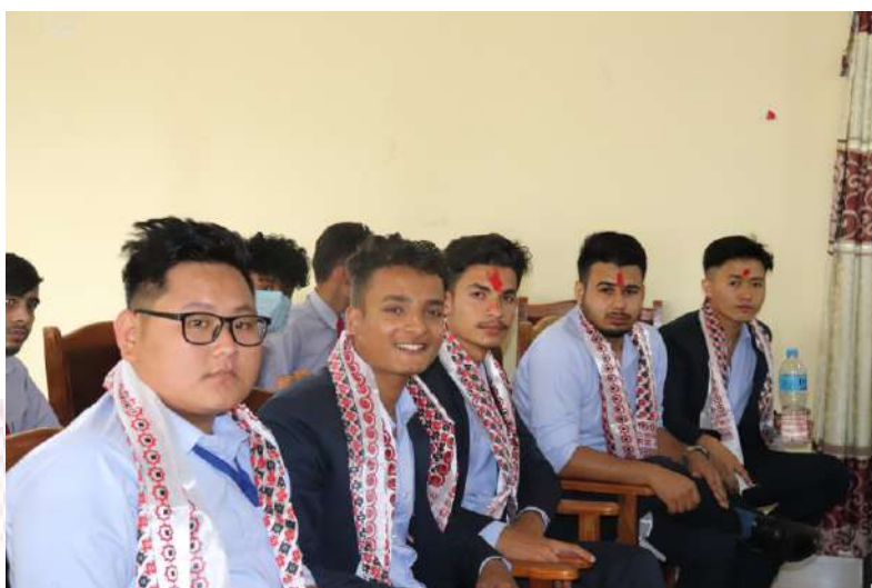
Students in Program