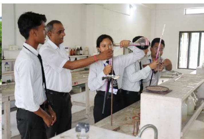
Students in Laboratory