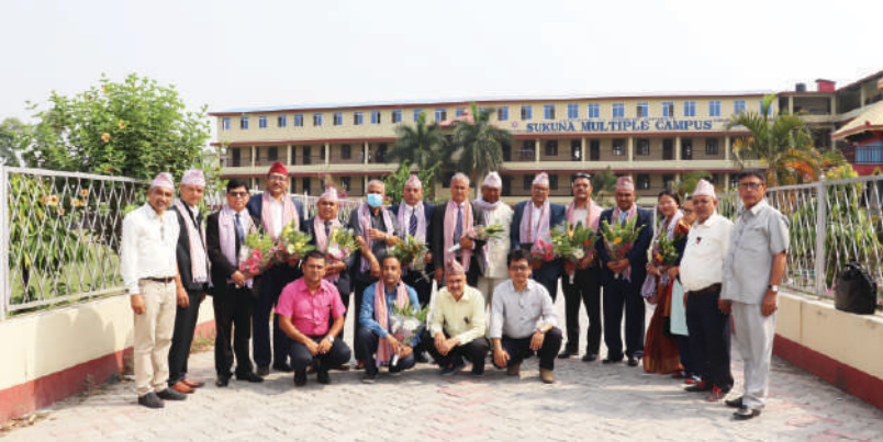
Campus Visit of the VCs of Different Universities