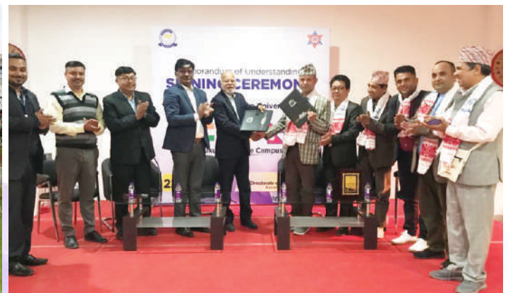
MOU with Asam Down Town University