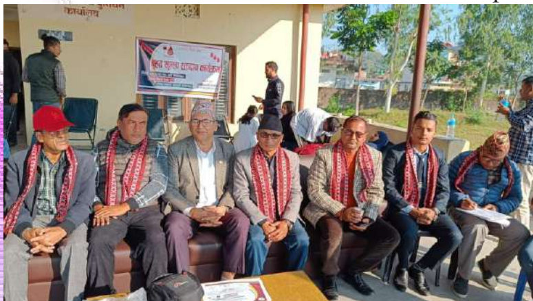
Sukuna ALUMNI Program

Note on Teaching Practice: 5 Weeks on Campus, 6 Weeks in School or Campus Practice, 1 Week Report Writing )