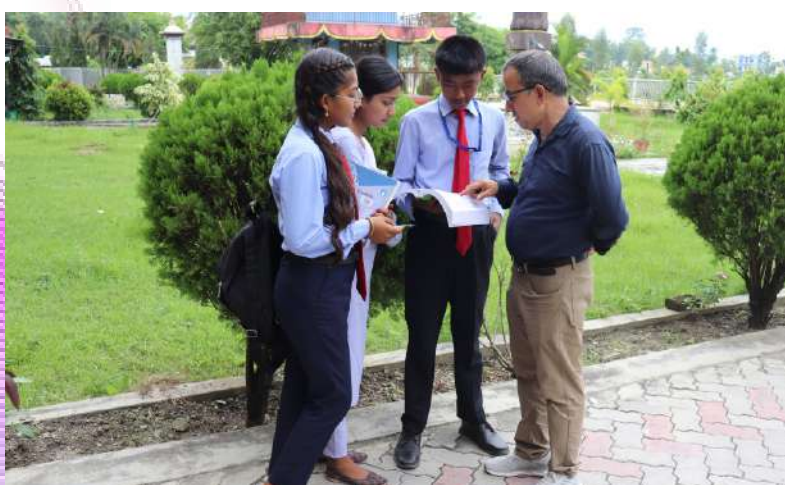
Teacher Student interaction