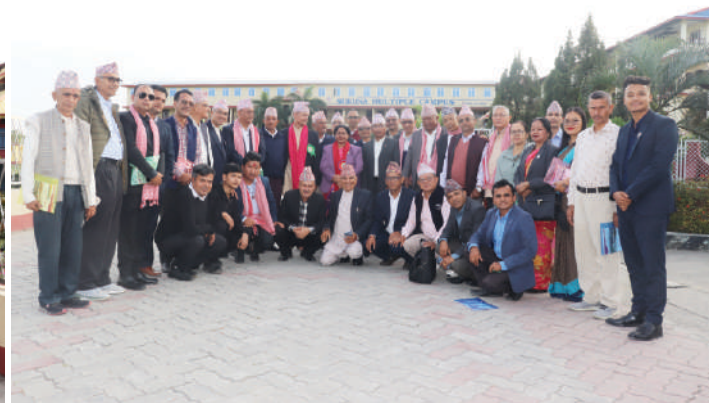
Honourable Education, Science and Technology State Minister in Sukuna