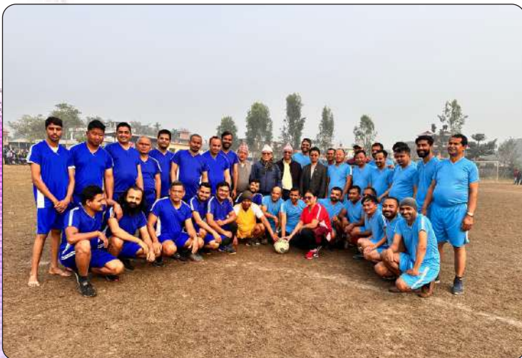
(Teacher & Staff Football)