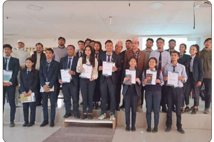
(Students awarded in Quiz)